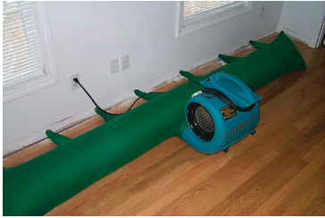
Prompt drying within the wall cavity can prevent mold development.