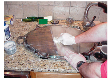
Emergency services after a fire damage includes cleaning metals (as with this homeowner's silver) and glass items. Soot is very corrosive and will cause irreversible etching if not cleaned promptly.