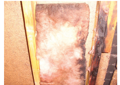
The smoke damaged insulation must be removed and the framing sealed before the repairs are completed to prevent lingering smoke odor.