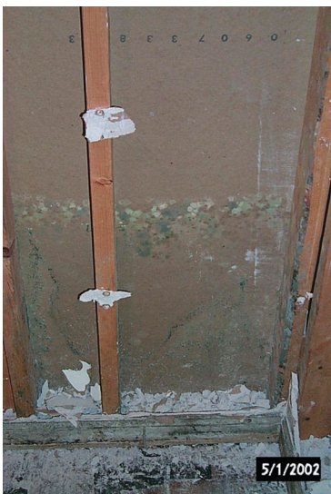
Removal of the mold infested sheetrock reveals mold growing within the wall cavity.

One of the most overused and misleading terms today is restoration . It appears everywhere—from references in design to remodeling to damage repair to remediation to mitigation. For a property owner, the differences in definition and real application are great, with very far reaching implications.