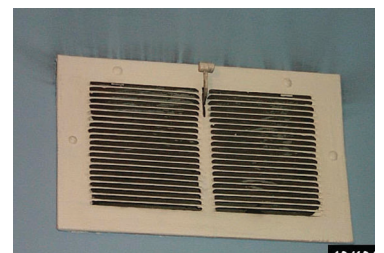
During a fire, soot can enter the HVAC System. Proper cleaning is required to prevent further contamination throughout the building and residual smoke odor.