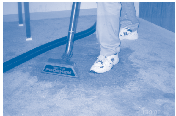
Both the carpet cleaner and restoration company will extract excess water in a water damage.

Call your local AFTERDISASTER ® Business Center today to find out more about this WIN-WIN networking and support.